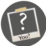
Writer, Editor, Designer, Photographer, Social Media, Web Designer Superstar! All Skills & Exp Welcome