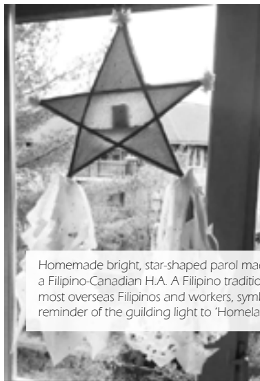
Homemade bright, star-shaped parol made by a Filipino-Canadian H.A. A Filipino tradition for most overseas Filipinos and workers, symbolising a reminder of the guiding light to ‘Homeland’

In Canada, the lack of permanent status has enabled the mistreatment and abuse of many migrants over the years. These federal programs remain employer-based and in-favor of the interests of the employers and many multi-million dollar operations. Literally, the “balikbayan” box is translated to “repatriate” or “return to country” box, which also means for many overseas Filipinos of “coming home” and of the cultural traditions of “pasalubong”. In these modern times of the labour export policies that allow the export of Filipino workers to over 170 countries and territories, the balikbayan box becomes a symbol of the Filipino diaspora.