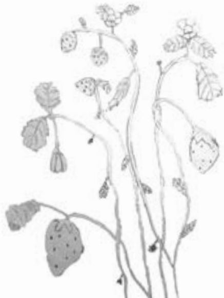
Illustrated by | Charlotte Chau

The plant diversity throughout the Strathcona and Cottonwood Community Gardens reflect the diversity of the surrounding community. This is represented by the culturally specific plants and foods that are grown throughout the gardens. Celebrating diversity and amplifying community voices helps us connect to our cultures and values. Connecting through community-led green spaces like the Strathcona and Cottonwood Community Gardens strengthens local food knowledge and shares it across generations. Volunteering in these spaces provides the opportunity to connect with local food systems, cultures and of course, community.